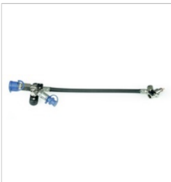
Airline Belt manifold with ASV